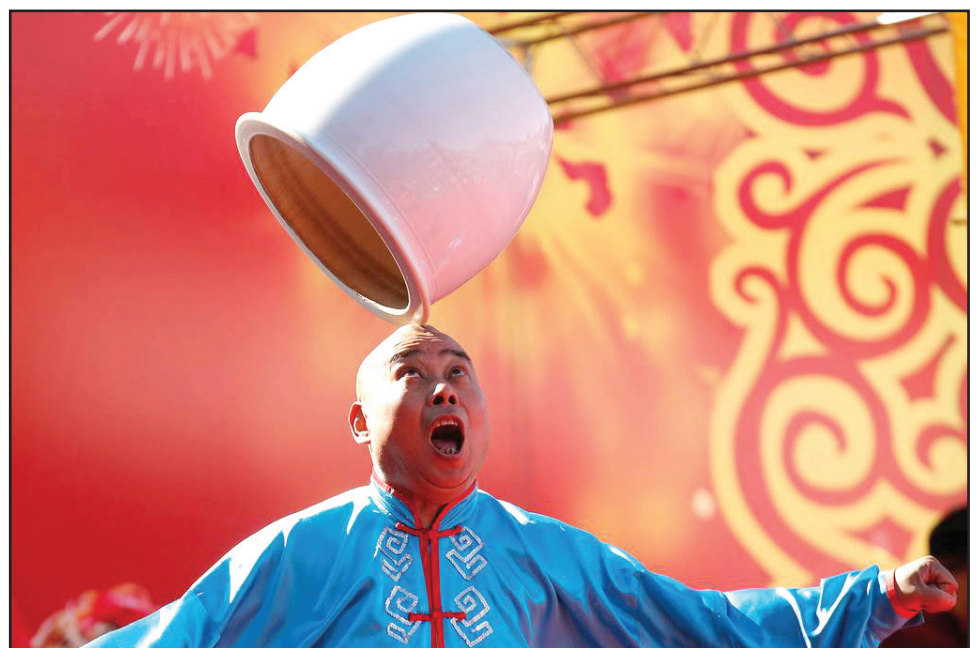
A performer takes part in the opening of the Temple Fair, part of Chinese New Year celebrations at Ditan Park, also known as the Temple of Earth, in Beijing