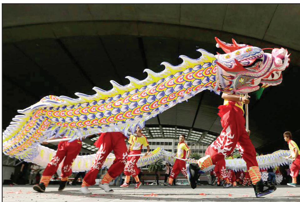
Filipino dancers perform a Dragon Dance on the eve of the Chinese New Year