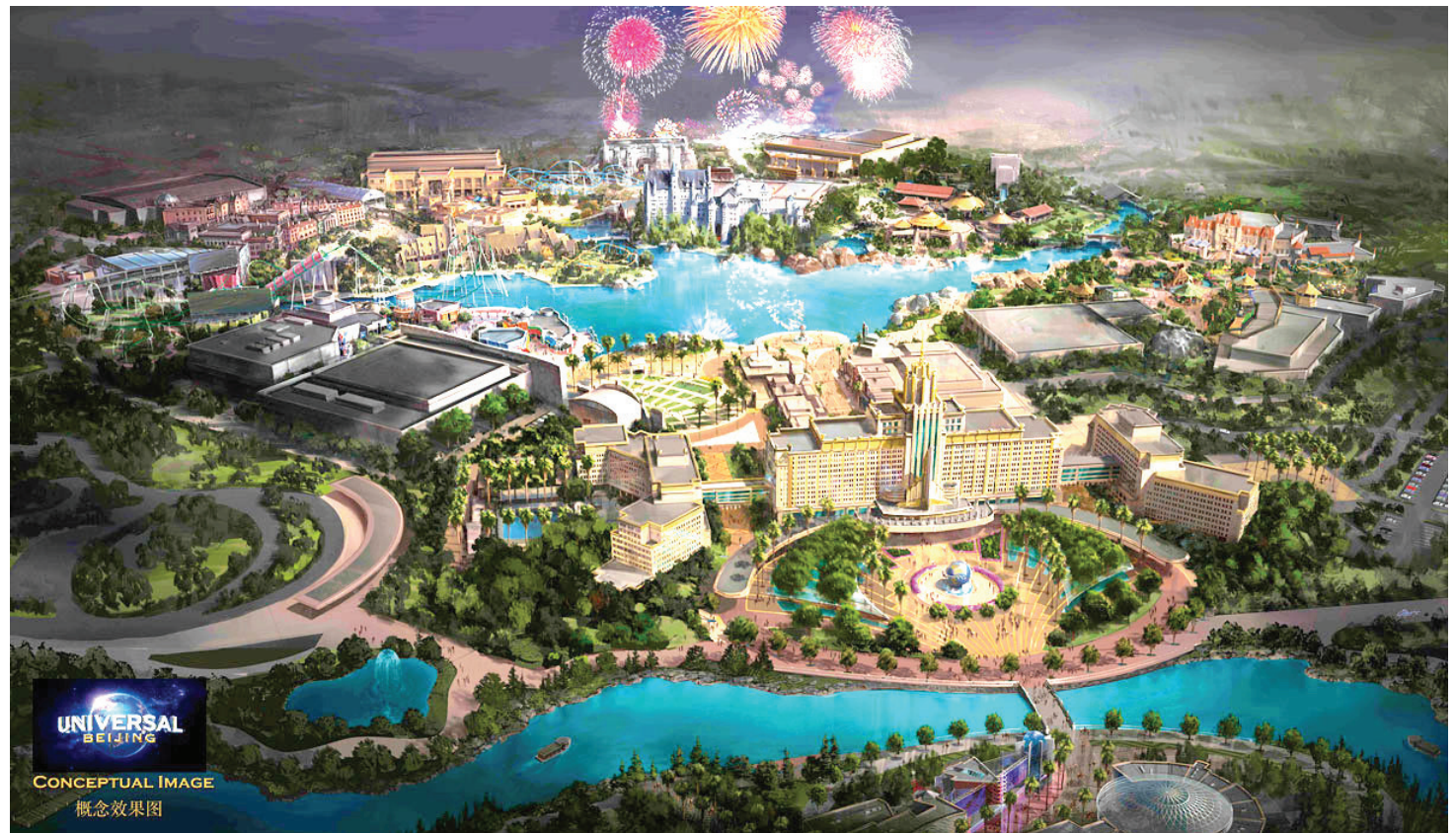
Beijing Universal Studio concept art

The giant theme park, operated by US cable company NBCUniversal, was the first to allow the public to experience action-packed entertainment and take a behind-the-scenes look at movie making.