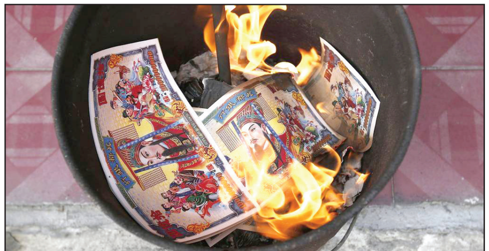
Paper money, called spirit money, is burnt in a bucket by an ethnic-Chinese Thai family in a traditional Chinese New Year ritual, believing that they will be passed onto their ancestors, at the front entrance of their shop-house home in Bangkok, Thailand