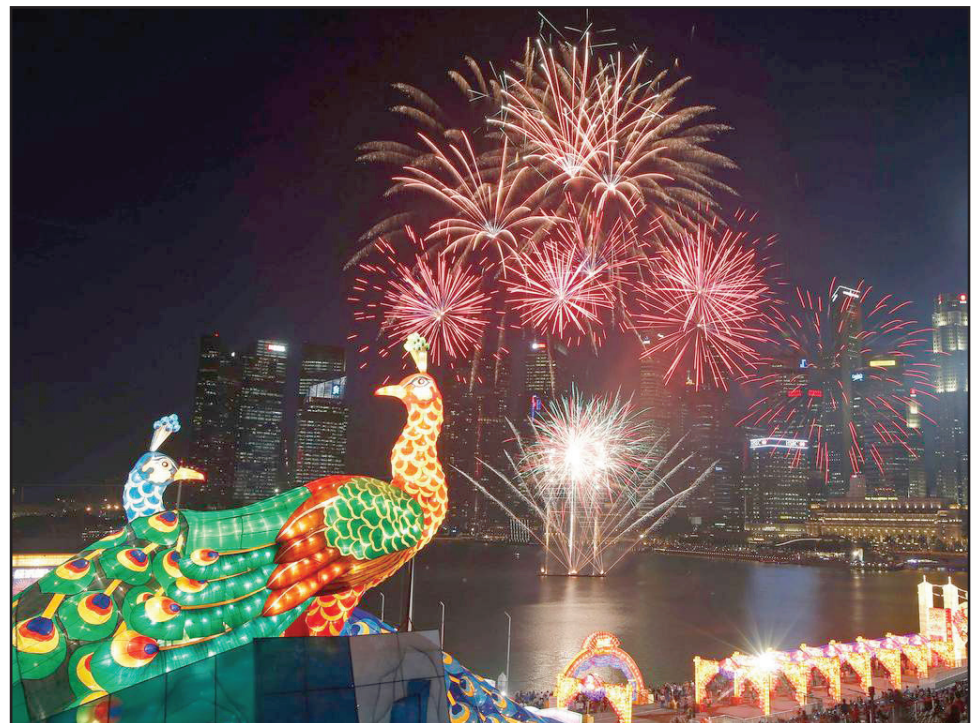
Fireworks explode at the River Hongbao Lunar New Year Celebrations along Marina Bay in Singapore